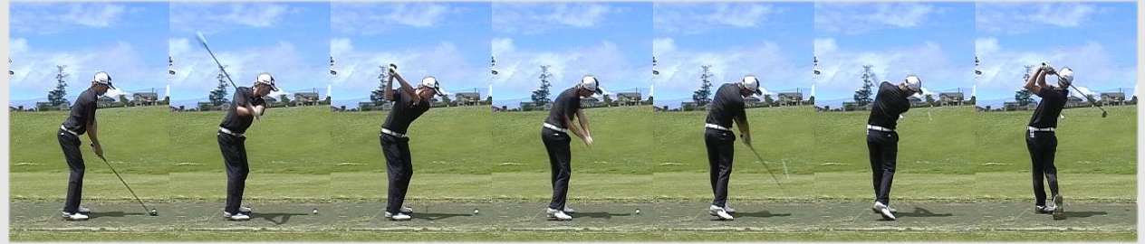
A swing sequence generated by SwingProfile